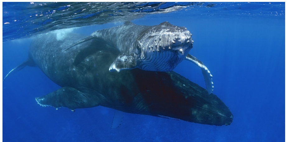
Marine mammals are particularly sensitive to noise and they rely heavily on sound to communicate, navigate, find prey and steer them away from danger. Consequently, loud man-made noises can distort messages and have far-reaching and damaging impact on aquatic life.

Man-made noise sources are often broadband by nature with varying energy levels in each frequency band. UAS is capable of solving the sound propagation of multiple frequencies. Frequencies range from 16 Hz to 40 kHz.