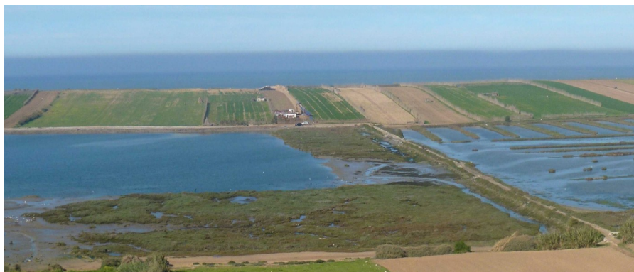
The Oualidia Lagoon.