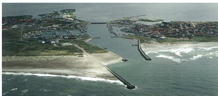
Aerial view of Hvide Sande Harbour, located at a tidal inlet on a sandy barrier, in the current harbour design

However, Hvide Sande Harbour faces some problems. The natural depth of the sand bars bypassing the harbour is only 2.5 m, not sufficient to accommodate today's fishing vessels that require a minimum depth of 6.0 m. Moreover, heavy sedimentation in the harbour's access channel, especially following storm events, hampers the safe passage of vessels and ships. Therefore, the authorities wished to increase the navigation depth in front of the harbour from the present 4.5-6.0 m while at the same time reducing sedimentation in the access channel.