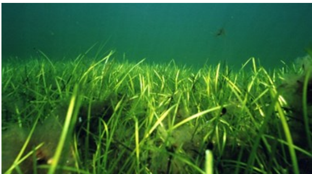
Reproduction and succession mechanisms determining the re-colonisation of eelgrass ( Zostera marina ) in Danish marine waters

Agent-based Modelling (ABM) is used for advanced simulations of behaviour and states of individuals or particles (which act as the agents driving aquatic ecosystem dynamics). ABM Lab – now a new feature in our ecological modelling tool ECO Lab – offers a unique integration of agent-based modelling with classical water quality and hydrodynamic modelling.