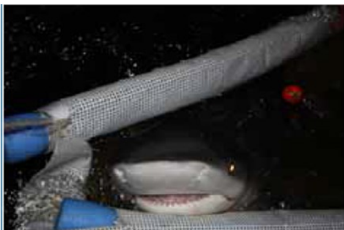
Linking movement behaviour modelling of Bull sharks ( Carcharhinus leucas ) with observation data from acoustic tagging of juvenile sharks in a semi-enclosed ecosystem, Australia

ABM Lab offers advanced solutions to Environmental Impact Assessments (EIAs) for aquatic organisms – whether it involves the behaviour of large animals such as mammals & fish or dispersal units like larvae, seeds and spores of aquatic organisms. For example, the response of large animals to disturbances like underwater noise from drilling or seismic surveys should preferably be based on baseline behaviour modelling. This takes into account seasonal migrations as well as meteorological and hydrodynamic changes.